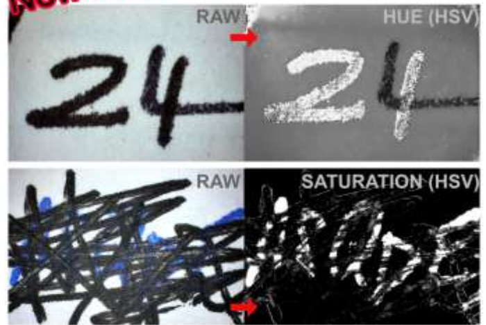
Video ToolBox Ultra with Live Color Space

PORTABLE DIGITAL MICROSCOPES FOR DOCUMENT EXAMINATION