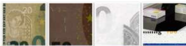
Backlight shows watermarks